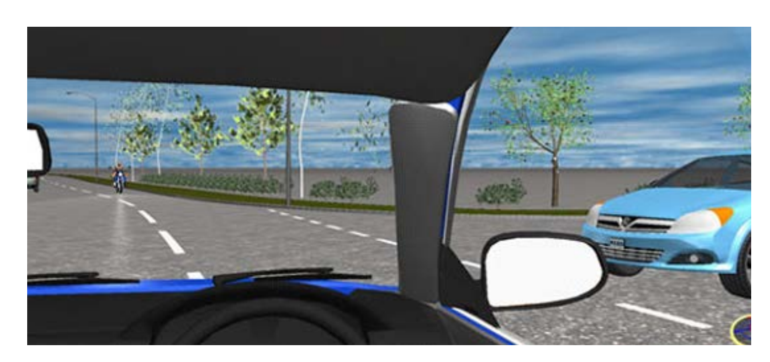
Scene from animation showing on-coming motorcycle with subject vehicle turning right across its path

Particularly for complex or multi-vehicle incidents, a high-fidelity visualisation of a collision can be extremely helpful in court. TRL are experts in combining 3D laser scan data of the scene with CCTV video, 3D vehicle models and other physical data collected by the collision response team, to recreate the chain of events based on the laws of physics.